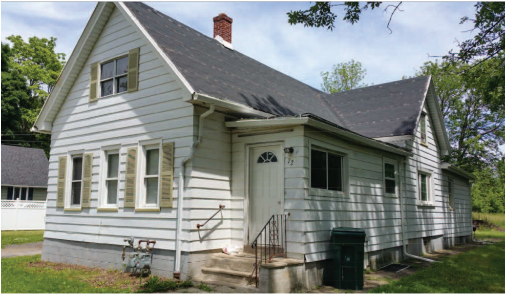
72 Stenton Street